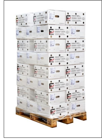
PALLET READY TO DELIVERY