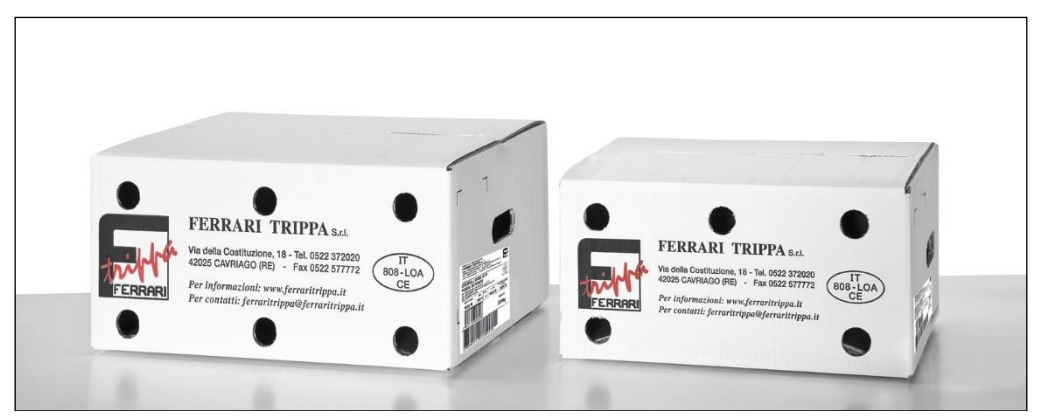
LABELED CARDBOARD TYPE